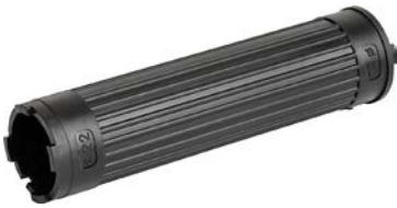
MSM 22 Installation Wrench