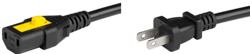
Power plug North America black

US Power cord with IEC connector C17, V-Lock, straight