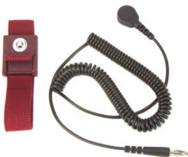
3M™ Wrist Strap MWS61M

This standard performance wrist strap set features a fully adjustable stretch fabric wrist band and coiled cord. The band provides 360 degree conductivity around the wrist for maximum skin contact. Band curling is reduced by the woven band fabric. The retractable coil cord connects to the wrist band via a 4mm post snap and contains a 1 megohm resistor. Includes alligator clip. Band available in blue or maroon.