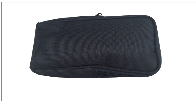
carrying bag - P/N: SC521