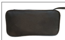
Carrying case supplied as standard

Supplied with : Instruction manual, Test leads (4mm), 2 x 1.5V AAA batteries, Carrying case.