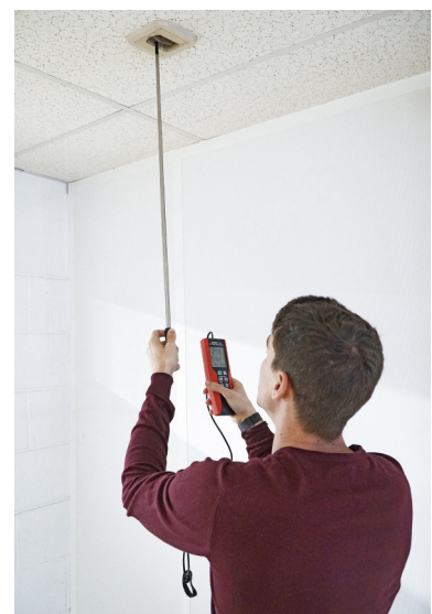
SEFRAM 9862 telescopic rod