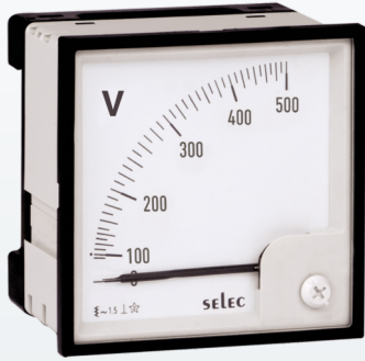
72 X 72 / 96 X 96mm