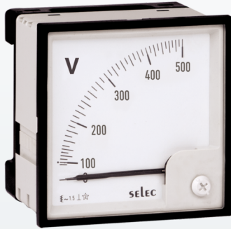
72 X 72 / 96 X 96mm