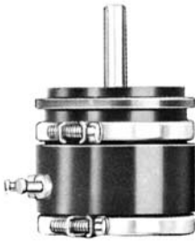
SERVO MOUNT/BALL BEARING MODEL 1521