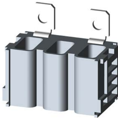
Adapter for screw mounting