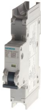
Miniature circuit breaker 240 V 14kA, 1-pole, D, 1 A, D=70 mm according to UL 489