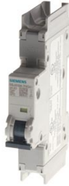
Miniature circuit breaker 240 V 14kA, 1-pole, C, 5A, D=70 mm according to UL 489