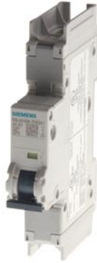
Miniature circuit breaker 240 V 14kA, 1-pole, D, 20 A, D=70 mm according to UL 489