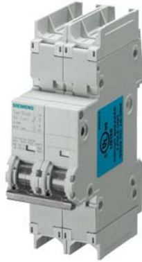
Miniature circuit breaker 240 V 14kA, 2-pole, C, 3 A, D=70 mm according to UL 489