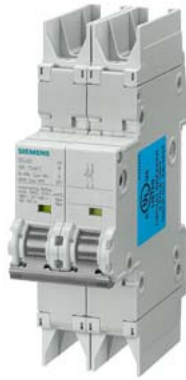
Circuit breaker 10kA, 2-pole, C, 4 A according to UL 489-480Y/277V