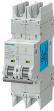
Circuit breaker 10kA, 2-pole, D, 20A according to UL 489-480Y/277V