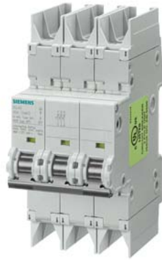
Circuit breaker 10kA, 3-pole, D, 30 A according to UL 489-480Y/277V