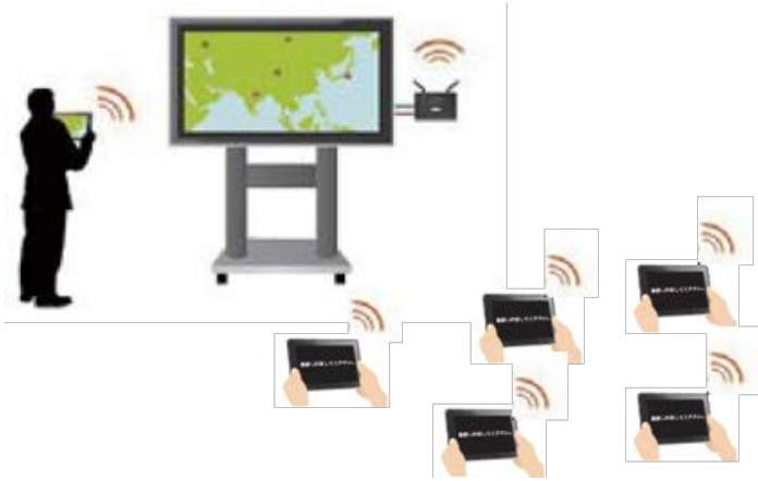
Real time wireless interactive collaboration between teacher and student including touch input and display.