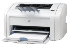
Standard Laser Printer