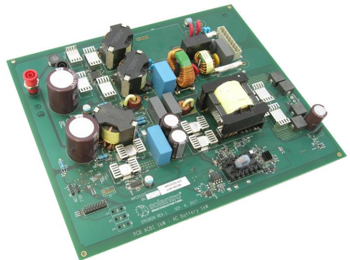
Figure 1 - AB-1KACBI Platform with efficiency curve

Solantro's Digital Power chipset can support a wide range of battery technologies and grid specifications for North American and international applications. The AB-1KACBI Development Platform includes two UART ports allowing the the SA4041 digital power processor to communicate with the Helios debug environment and standard terminal window (PuTTY). This solution allows customers to develop products with quick time-to-market requirements.