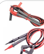
Set of test leads