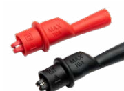
Crocodile clip mini, 1 kV 10 A (set)