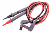
Set of test leads CAT IV, M