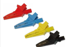
Crocodile clip red / blue / yellow / black

WASONREOGB1 WASONBUOGB1 WASONYEOGB1 WASONBLOGB1 WASONBLOGB3