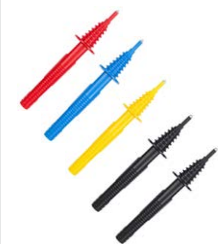
Pin probe (banana socket) red / blue / yellow / black B1 / black B3

WASONREOGB1 WASONBUOGB1 WASONYEOGB1 WASONBLOGB1 WASONBLOGB3