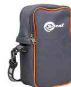
M13 carrying case