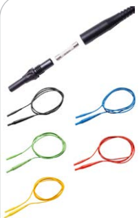
Test lead 2 m with 10 A fuse CAT IV 1000 V black / blue / green / red / yellow

WAPRZ002BLBBF10 WAPRZ002BUBBF10 WAPRZ002GRBBF10 WAPRZ002REBBF10 WAPRZ002YEBBF10