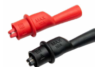
Crocodile clip mini, 1 kV 10 A (set)