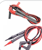
Set of test leads