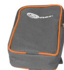
S1 carrying case