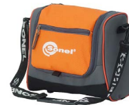
M-6 carrying case WAFUTM6