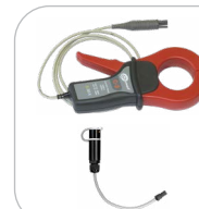
C-3 clamp WACEGC30KR C-3 clamp adapter WAADALKOC8