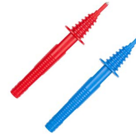
Test probe with banana socket; 1 kV; red / blue WASONREOGB1 WASONBUOGB1