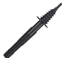
Pin probe, black 11 kV (banana socket) WASONBLOGB11