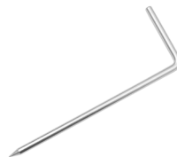
Earth contact test probe (rod) 25 cm WASONG25