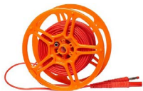
Test lead with banana plugs on reel; 1 kV; 20 m; red WAPRZ020REBBSZ