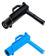
Magnetic voltage adapter black / blue WAADAUMAGKBL WAADAUMAGKBU