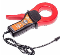
C-8 clamp WASONCEGC8