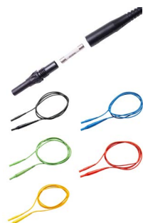
Test lead 2 m CAT IV 1000V (banana plugs, fused 10 A) black / blue / green / red / yellow WAPRZ002BLBBF10 WAPRZ002BUBBF10 WAPRZ002GRBBF10 WAPRZ002REBBF10 WAPRZ002YEBBF10