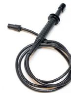
Non-contact probe WASONBDOT