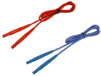
Test lead with banana plugs; 1 kV; 1.2 m; red / blue WAPRZ1X2REBB WAPRZ1X2BUBB