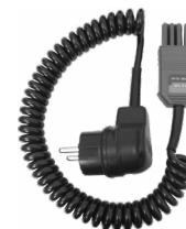
WS-05 adapter with UNI-SCHUKO angular plug WAADAWS05