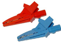
Crocodile clip 1 kV 20 A red / blue WAKRORE20K02 WAKROBU20K02