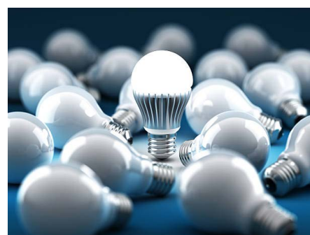
Measurement of LED lighting

Device of the highest class A thanks to cooperation with LP-10A measuring probe. Therefore it allows to make the most accurate measurements in industrial zones and public facilities. In addition, the instrument has the ability to wirelessly send data to Sonel Reader PC software.