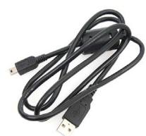
MINI-B 5 USB data transmission cable WAPRZUSBMNIB5