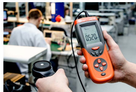
Measurement of workplaces

Model for people making basic lighting measurements of indoor and outdoor workplaces. The device works with LP-1 measuring probe (class B) which allows to proceed with measurements in a reliable way. The non-integrated probe eliminates the influence of the user to the measurement result.