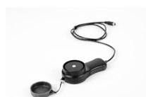
LP-10A measuring probe (for LXP-10A) WAADALP10A