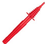
test probe with banana socket; 1 kV; red