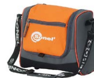
M-6 carrying case