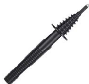
test probe with banana socket; 1 kV; black