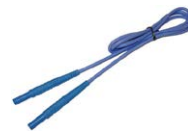
test lead with banana plugs; 1 kV; 1.2 m; blue