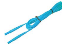
test lead 5 m, blue, 1 kV (banana plugs)