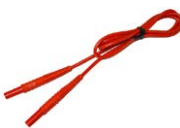
test lead with banana plugs; 1 kV; 1.2 m; red