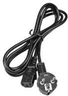
Mains power cable Uni-Schuko / IEC C13 plug