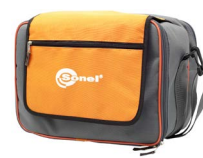
L4 carrying case