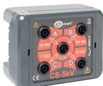
CS-5kV cali- bration box

WAPRZ003REBB10K WAPRZ005REBB10K WAPRZ010REBB10K WAPRZ020REBB10K