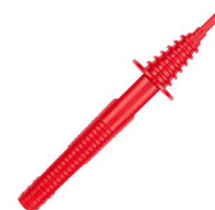
Pin probe 11 kV (banana socket) red