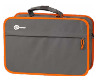
L2 carrying case