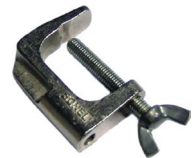
Cramp with banana socket