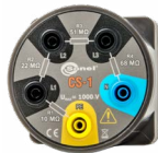
CS-1 cable simulator