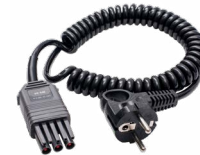
WS-04 adapter with UNI-SCHUKO angular plug