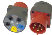
Three-phase socket adapter 16 A / 32 A