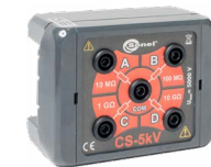
CS-5kV cali- bration box