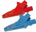
Crocodile clip 1 kV 20 A red /blue