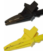
Crocodile clip 1 kV 20 A black / yellow