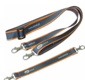
L2 hanging straps (set)