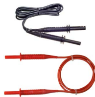
Test lead 5 kV 1.8 m (banana plugs) black shielded / red