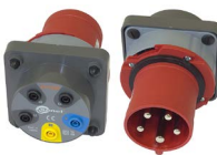
Three-phase socket adapter 63 A