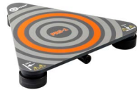
PRS-1 resistance test probe