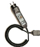
WS-03 adapter with START button with UNI-Schuko plug (CAT III 300 V)