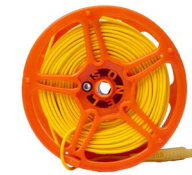
Test lead for earth resistance mea- surement 50 m