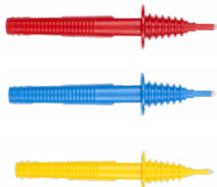
Pin probe 1 kV (banana socket) red / blue / yellow