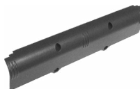
Battery pack 4xLR14