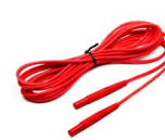
Test lead for fault loop measurement (banana plugs) 5 m / 10 m / 20 m