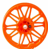
Test wire reel