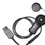
LP-10A light meter probe with WS-06 plug