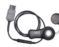
LP-1 light me- ter probe with WS-06 plug