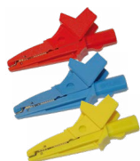
Crocodile clip 1 kV 20 A red / blue / yellow