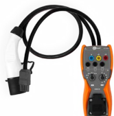
EVSE-01 adapter for testing vehicle charging stations