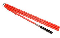
Foldable pin probe, 1 kV, 2 m (banana socket)