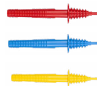
Pin probe 1 kV (banana socket) red / blue / yellow