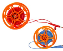
Test lead for earth resistance measurement 25 m red / blue