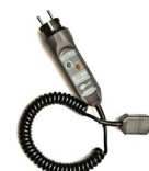
WS-03 adapter with START button with UNI-Schuko plug (CAT III 300 V)