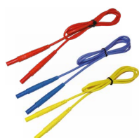
Test lead 1.2 m (banana plugs) red / blue / yellow