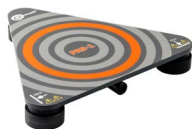
PRS-1 resistance test probe