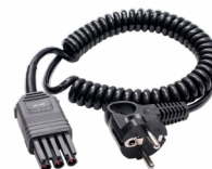
WS-04 adapter with UNI-SCHUKO angular plug