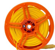
Test lead for earth resistance mea- surement 50 m