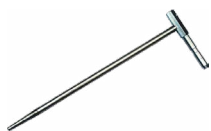
2x earth contact test probe (rod), 30 cm