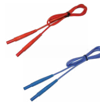
Test lead 1.2 m (banana plugs) red / blue