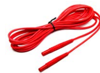
Test lead 5 / 10 / 20 m red 1 kV (banana plugs)