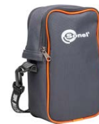
M13 carrying case