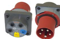
Three-phase socket adapter 63 A