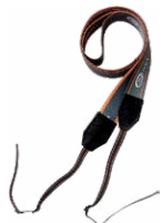
M1 hanging straps