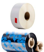
Accessories for SATO printer