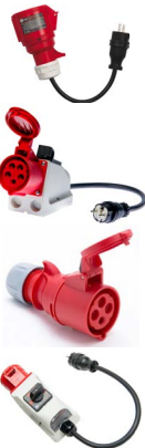
Three-phase socket adapter 32 A