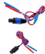
Double-wire test lead

1.5 m (PAT plug/banana plugs) WAPRZ1X5DZBB