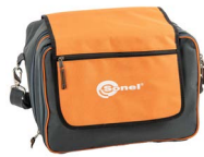
L-11 carrying case