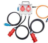
PAT-3F-PE adapter for leakage current measurement