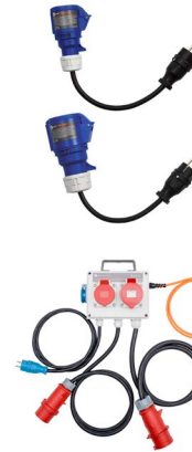
3P industrial socket adapter