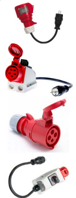
Three-phase socket adapter 16 A