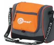
M6 carrying case