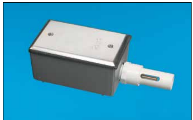
Outdoor Air Sensor with Weatherproof Box