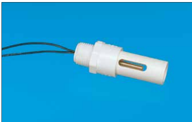
Standard Outdoor Air Temperature Sensor