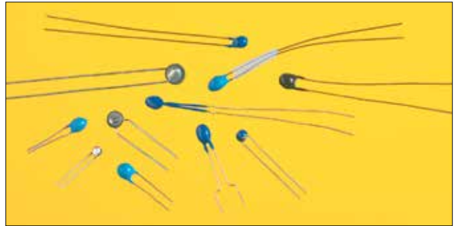
Standard Disc Style