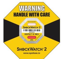
ShockWatch 2 with ring label.