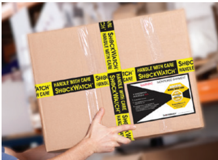
ShockWatch 2 shown with companion label to accommodate the ring label and alert tape.