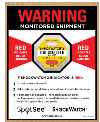
ShockWatch 2 shown with companion label.