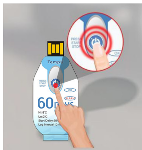
Press the button to start