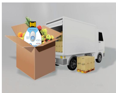
Pack into shipment