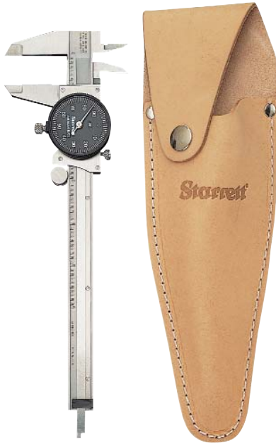
Below: 6" Caliper with convenient holster.