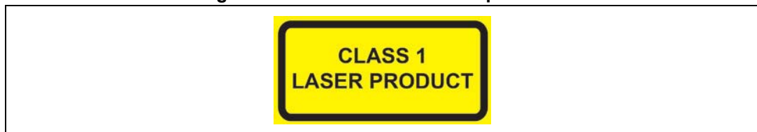
Figure 1. Label for Class 1 laser products

The VL53L0X contains a laser emitter and corresponding drive circuitry. The laser output is designed to remain within Class 1 laser safety limits under all reasonably foreseeable conditions including single faults, in compliance with IEC 60825-1:2014 (third edition). The laser output will remain within Class 1 limits as long as STMicroelectronics recommended device settings are used and the operating conditions, specified in the STM32L4 Series datasheets, are respected. The laser output power must not be increased by any means and no optics should be used with the intention of focusing the laser beam. Figure 1 shows the warning label for Class 1 laser products.