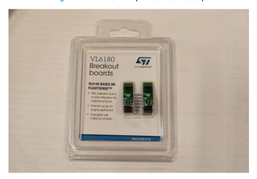
Figure 3. VL6180-SATEL (2x breakout boards)