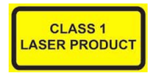
Figure 4. Class 1 laser product label

The VL6180 contains a laser emitter and corresponding drive circuitry. The laser output is designed to remain within Class 1 laser safety limits under all reasonably foreseeable conditions, including single faults, in compliance with the IEC 60825-1:2007. The laser output remains within Class 1 limits as long as the STMicroelectronics recommended device settings are used and the operating conditions specified in the datasheet are respected. The laser output power must not be increased and no optics should be used with the intention of focusing the laser beam.