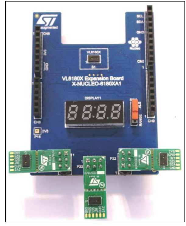
Figure 2. Connections of VL6180X satellite boards

Note: VL6180X satellite boards can be ordered under the reference: VL6180X-SATEL.