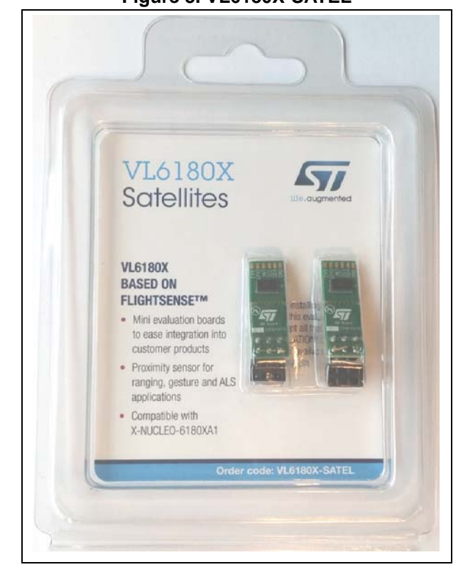
Figure 3. VL6180X-SATEL

Note: VL6180X satellite boards can be ordered under the reference: VL6180X-SATEL.