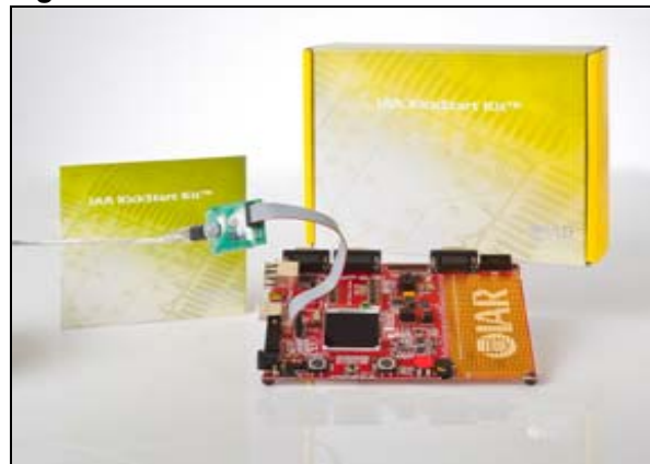
Figure 2. Starter kit

IAR KickStart kits are available for a full range of ST ARM core-based microcontrollers.