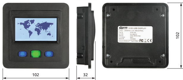
All dimensions in mm