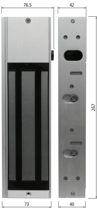
All dimensions in mm