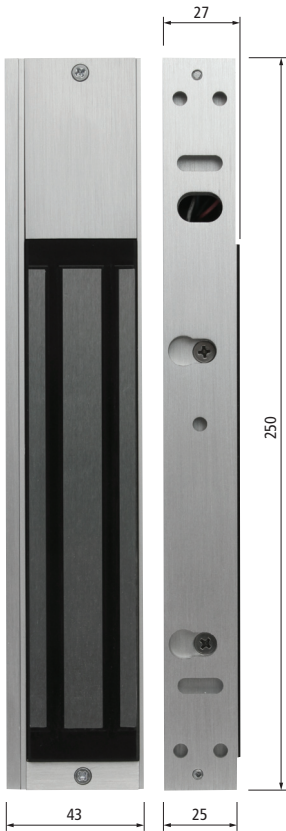
All dimensions in mm