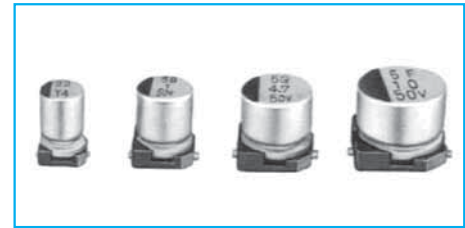
Marking color : Black print