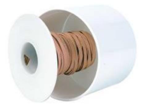
1803-25F Pro Wick Green #3 Braid 25' 1 units/case