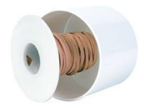
1804-25F Pro Wick Blue #4 Braid 25' 1 units/case