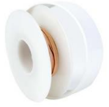
1805-5F 25 units/case