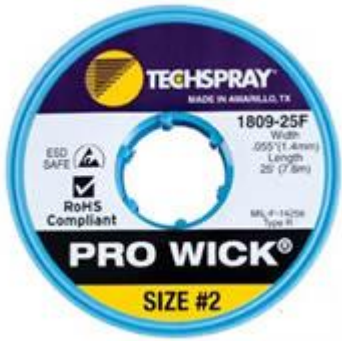
1810-25F Pro Wick Green #3 Braid - AS 25' 1 units/case