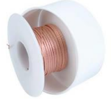
1806-100F Pro Wick Red #6 Braid 100' 1 units/case