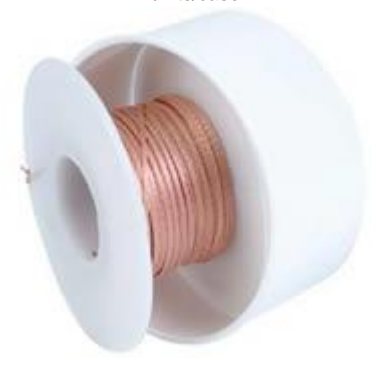
1809-25F Pro Wick Yellow #2 Braid - AS 25' 1 units/case