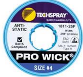
1813-5F Pro Wick Red #6 Braid - AS 5' 25 units/case