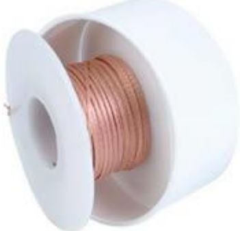
1804-10F Pro Wick Blue #4 Braid 10' 25 units/case