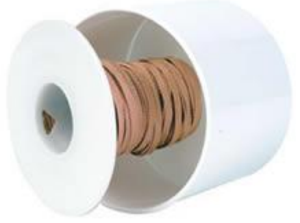
1804-25F Pro Wick Blue #4 Braid 25' 1 units/case