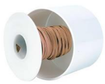
1808-5F Pro Wick White #1 Braid - AS 5' 25 units/case