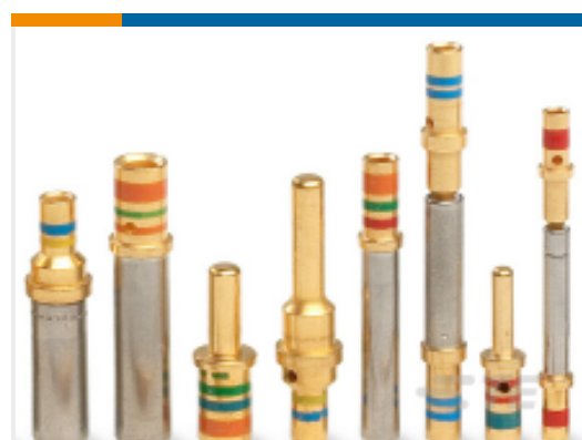
TE Part #0660-206-1631L CONT PIN