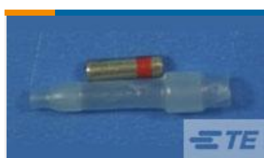
TE Part #650074N006 D-436-36CS454