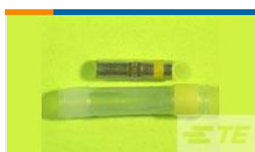
TE Part #650075N003 D-436-37CS454