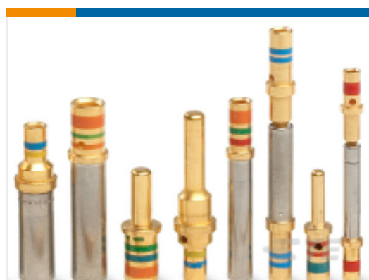
TE Part #0662-207-1282 CONT SOC ASSY