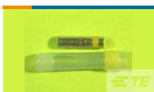
TE Part #6500760004 D-436-38CS454