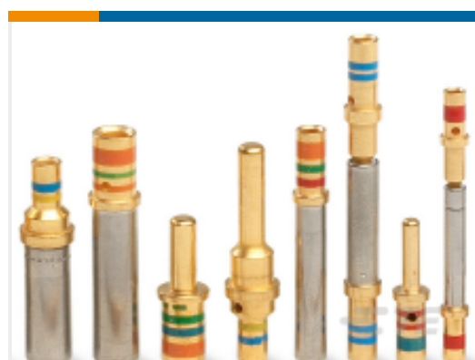
TE Part #0662-207-1631L CONT SOC ASSY