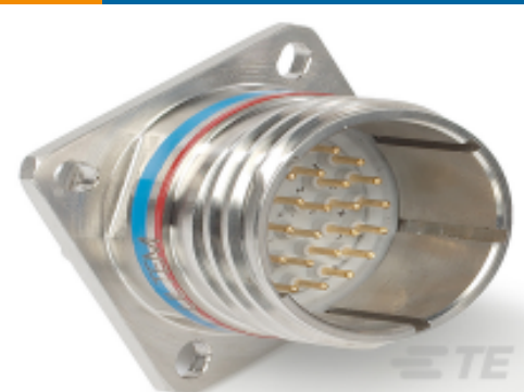
TE Part #DTS20W25-19SA RECP ASSY