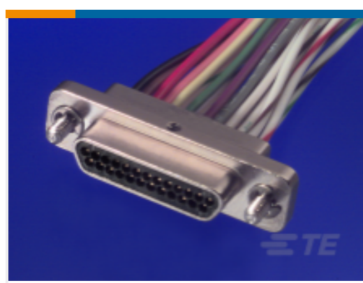
TE Part #1532211-2 M83513/01-CC, MCKS-C2- B-21PS