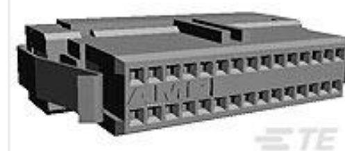
TE Part #111196-5 024 RCPT SYSTEM 50 30 DPLX