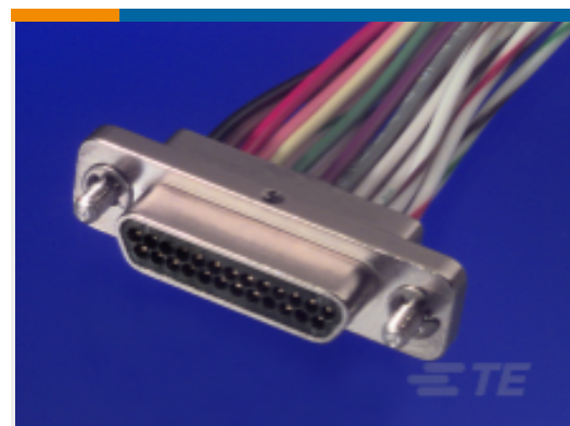
TE Part #1532203-2 M83513/02-CC, MCKS-C2-B-21SS