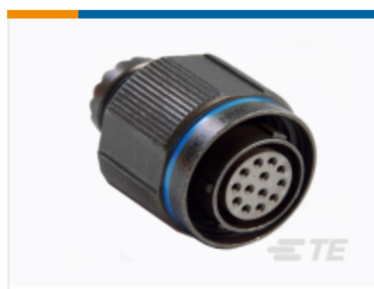
TE Part #DTS26W25-29PC PLUG ASSY