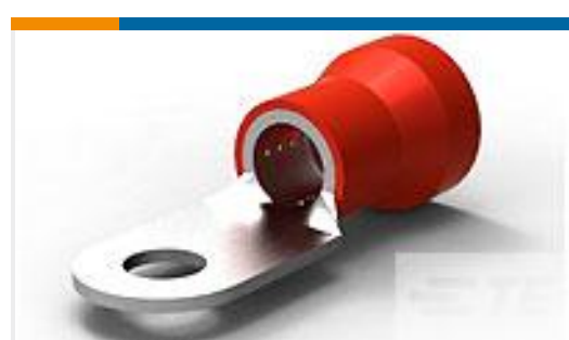
TE Part #52044-1 TERMINAL R PG 2 5/16