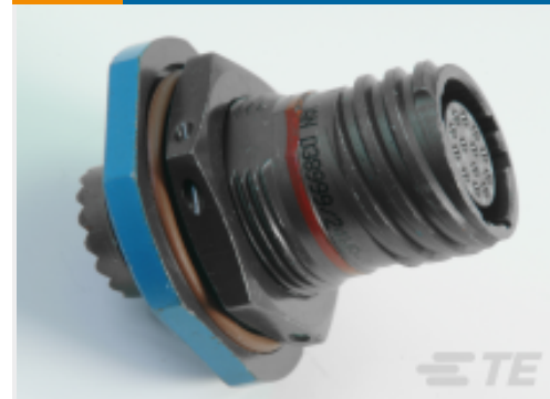
TE Part #DTS24W21-35SN RECP ASSY