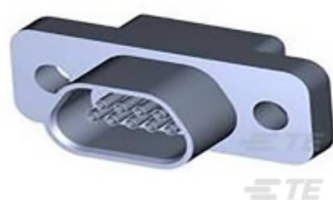
TE Part #1532187-2 M83513/02-AC, MCKS-C2-B-9SS