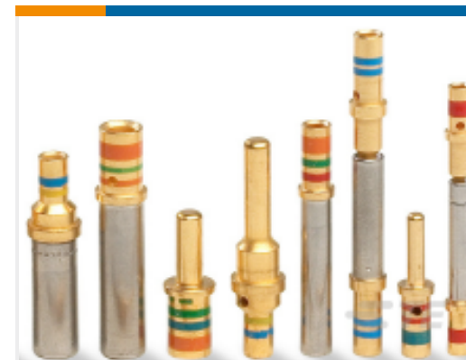
TE Part # ZPF000000000121739 182-0862-22