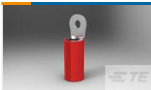
TE Part #131648-1 TERMINAL RING TONGUE PIDG 22 18