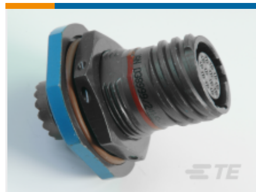
TE Part # YACT24MC35PBV00100 JAM NUT RECEPTACLE