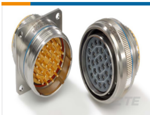
TE Part # ZPF000000000007510 983-0SE 10-06 S8 L