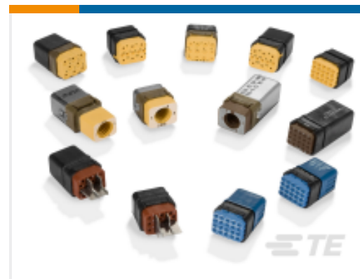
TE Part # ZPF0000000000015218 DMC-M 08-16 AN